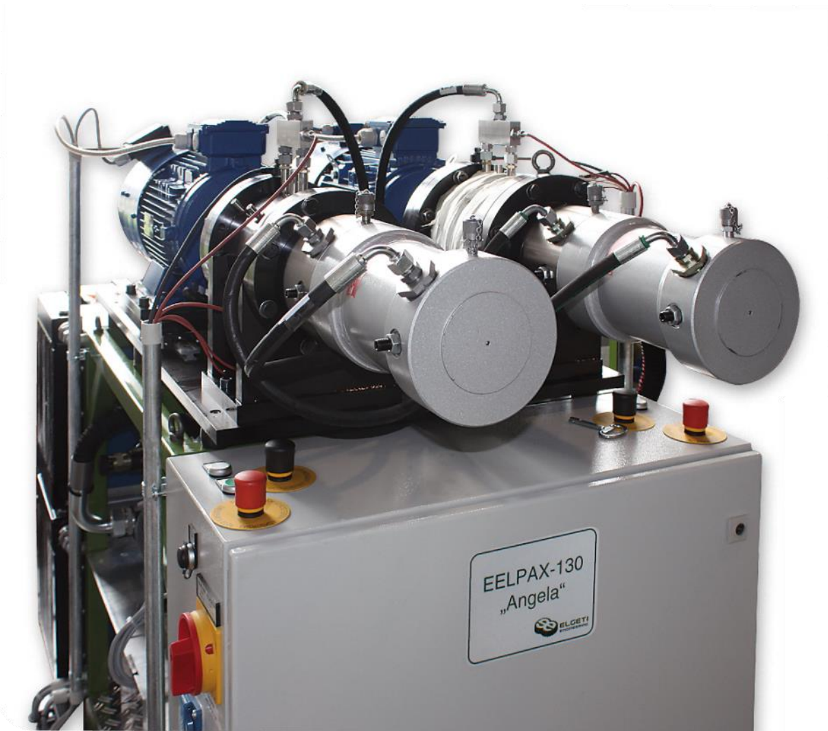
Figure 2: EELPAX-130 (left station equipped with heating; control PC at separate position)