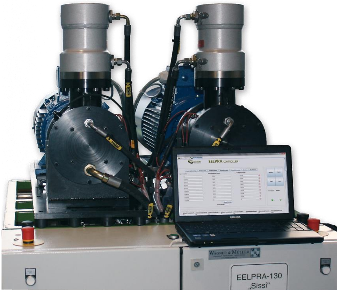
Figure 2: EELPRA-130